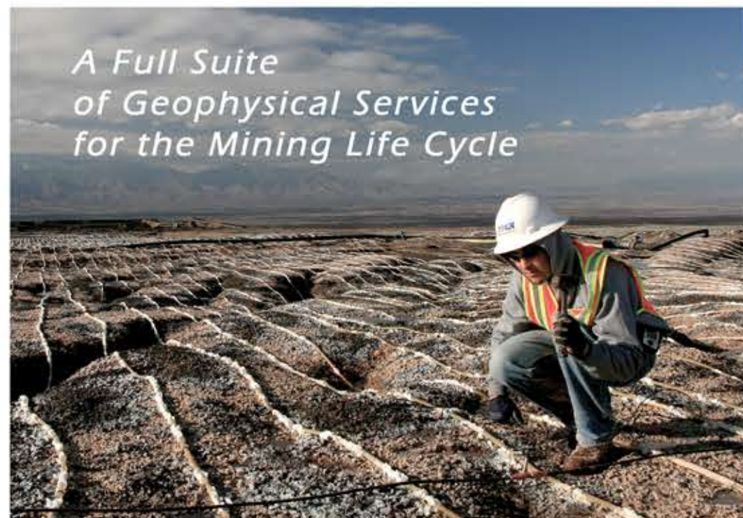
A Full Suite of Geophysical Services for the Mining Life Cycle

Innovation, quality, and flexibility are hallmarks of HGI's geophysical services. HGI creates custom-fit solutions for individual client needs, making us an industry leader in the field of geophysics and geosciences.