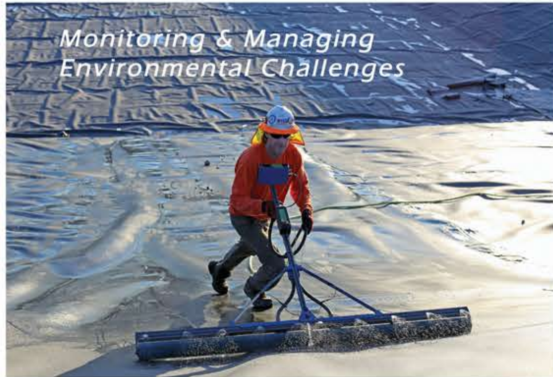
Monitoring & Managing Environmental Challenges

HGI uses advanced geophysical technologies to map the presence, or movement, of mining-impacted water. We develop site-specific surveys to find your source, understand the impact, and provide recommendations to mitigate your risk.