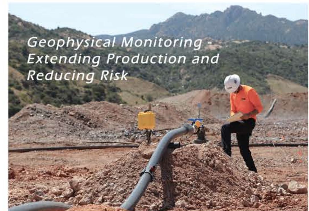
Geophysical Monitoring - Extending Production and Reducing Risk

Enhanced recovery programs can yield an additional 2% to 5% of total metal recovered in just a few years, with a significant return on investment. HGI has developed a set of monitoring and validation tools that can track the success of subsurface leaching, assuring the delivery on that investment.